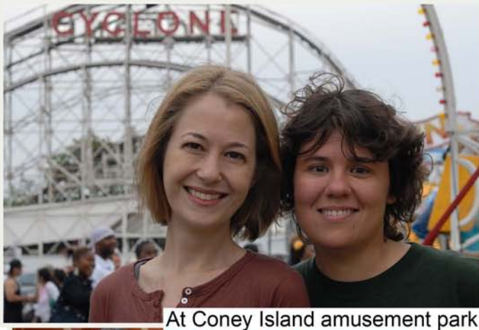
At Coney Island amusement park.