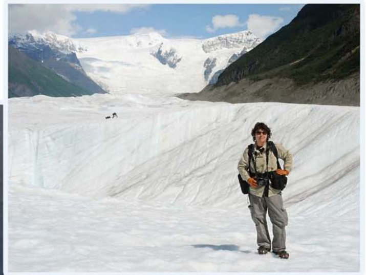
Hiking to the top of a glacier to get the perfect shot!