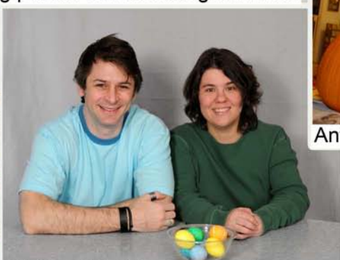
Old friend Brit lives around the corner.