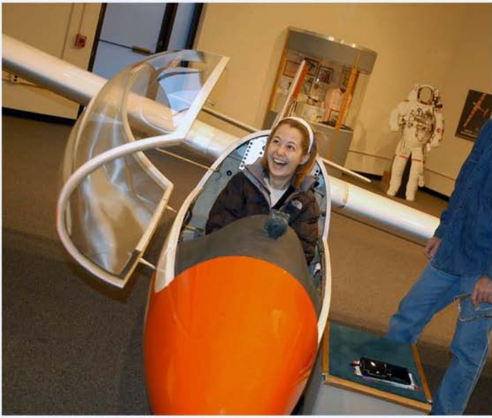
Trying out the pilot's seat at a museum exhibit.