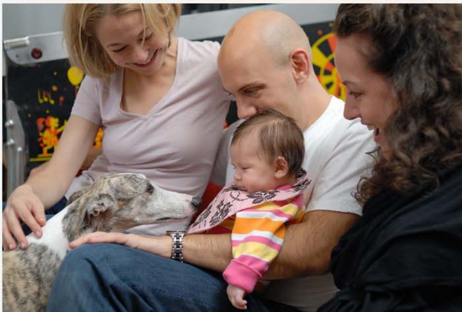
Our dog Nike is a sweet and loyal companion. He is very gentle with children and loves being hugged and petted by our friends.

We cherish quiet times at home. A highlight is relaxing at dinner and talking through the challenges and triumphs of the day. We can always make each other laugh, and by dessert everything is usually in perspective. Every day we focus on appreciating the life and love we have. We can't wait to welcome a child into our family, and build new traditions together.