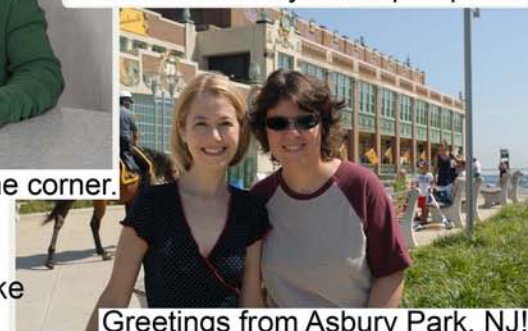
Greetings from Asbury Park, NJ!

We enjoy investigating the amazing opportunities the city offers kids with our friends and their children. On the weekends one of our favorite things to do is take road trips to the beaches, towns and offbeat places nearby.