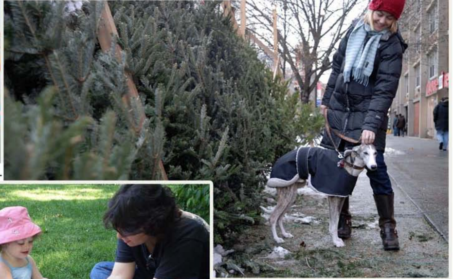
A Christmas tree stand sets up right outside our apartment each year.