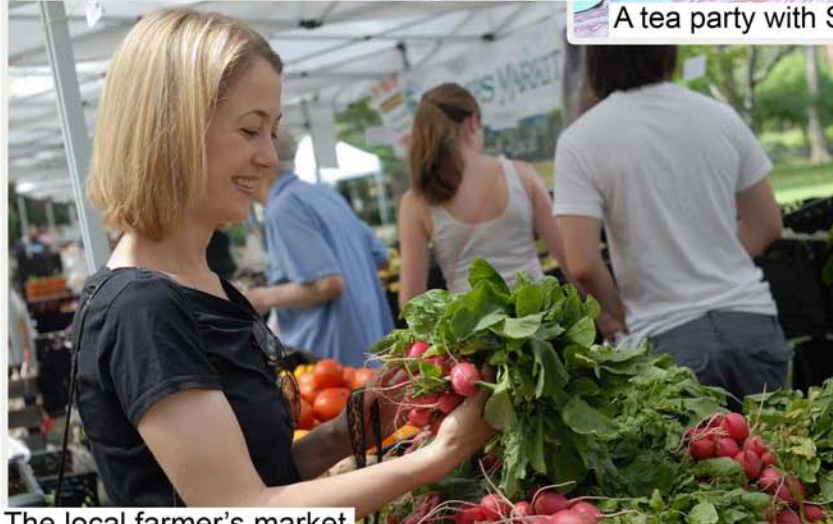
The local farmer's market.