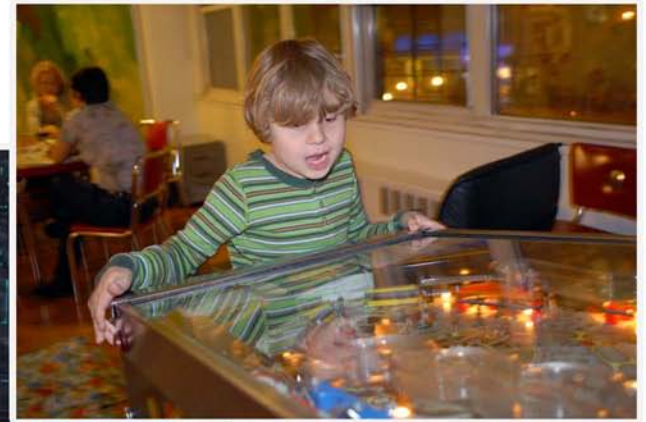
The pinball machine in our living room is a big hit with friends of all ages.

We cherish quiet times at home. A highlight is relaxing at dinner and talking through the challenges and triumphs of the day. We can always make each other laugh, and by dessert everything is usually in perspective. Every day we focus on appreciating the life and love we have. We can't wait to welcome a child into our family, and build new traditions together.