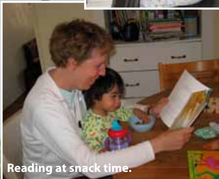
Reading at snack time.

Our work focuses on education and alternative health care.