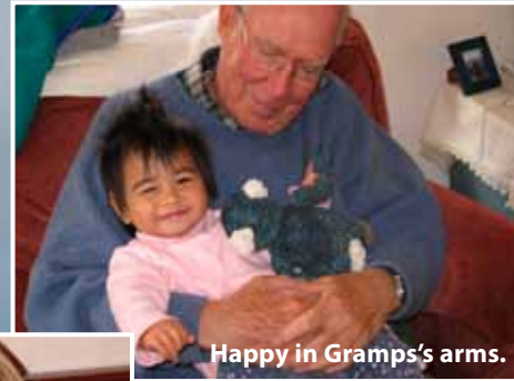
Happy in Gramps's arms.