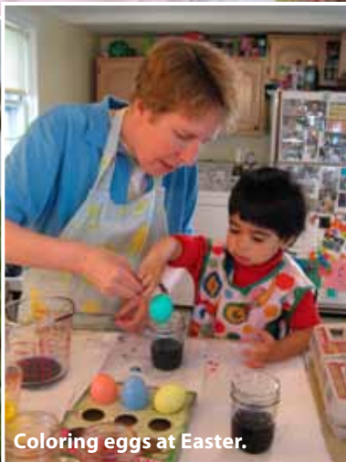
Coloring eggs at Easter.