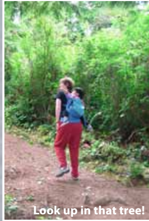
Look up in that tree!