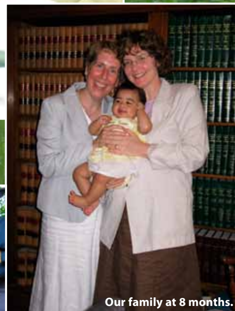
Our family at 8 months.