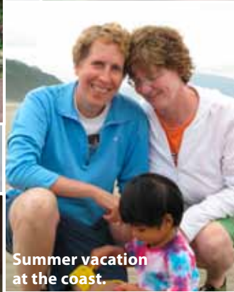
Summer vacation at the coast.