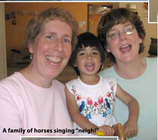
A family of horses singing "neigh!"