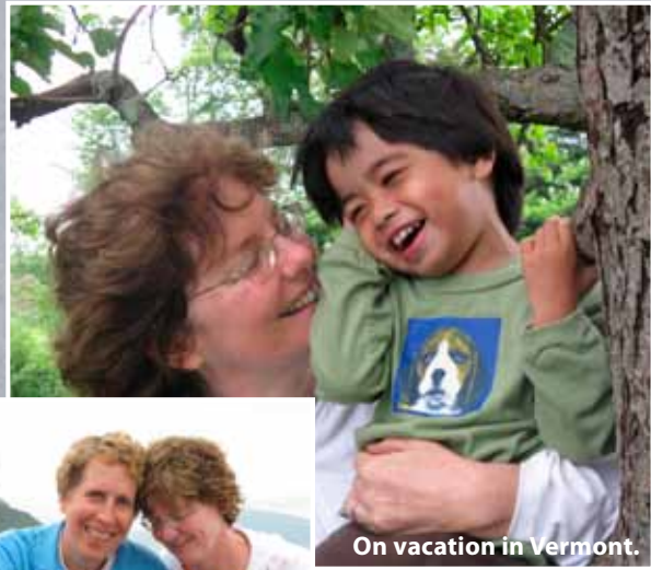
On vacation in Vermont.