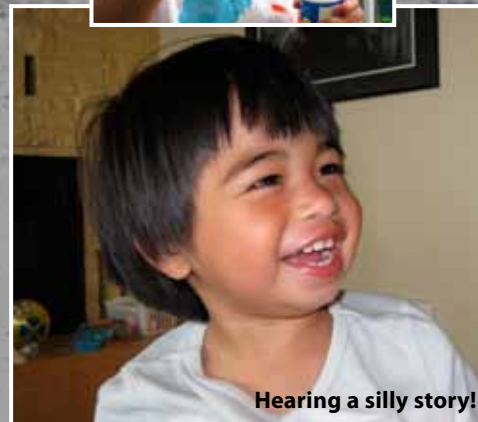
Hearing a silly story!