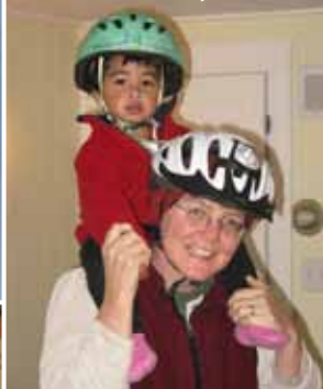
Back from a bicycle ride.