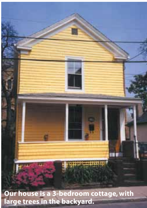
Our house is a 3-bedroom cottage, with large trees in the backyard.