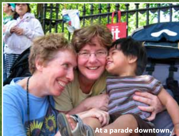
At a parade downtown.