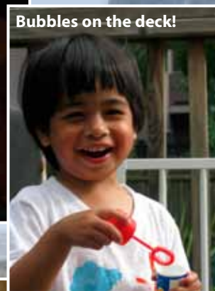
Bubbles on the deck!