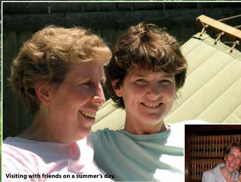
Visiting with friends on a summer's day.