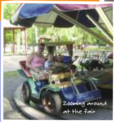
Zooming around at the fair