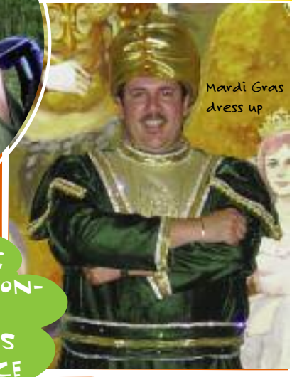
Mardi Gras dress up