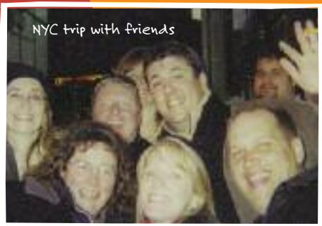
NYC trip with friends