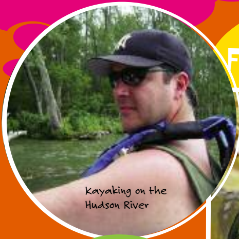
Kayaking on the Hudson River