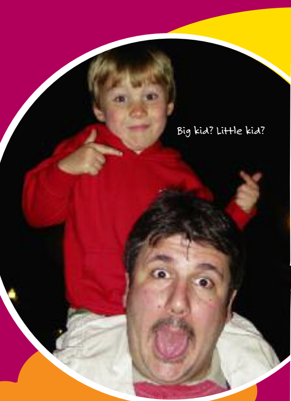
Big kid? Little kid?