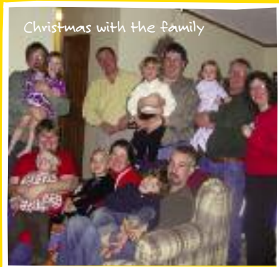
Christmas with the family