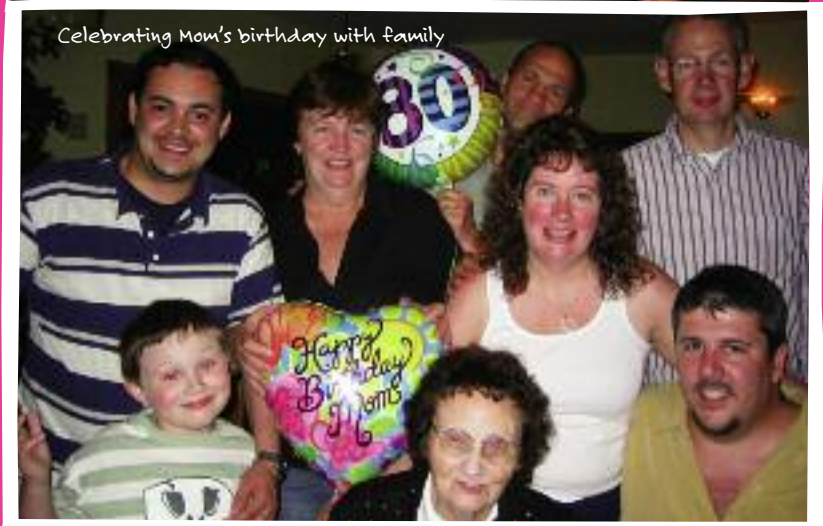
Celebrating Mom's birthday with family