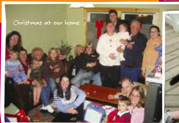
Christmas at our home

WHETHER IT IS GATHERING FOR THE HOLIDAYS OR JUST A WEEKEND BAR-B-QUE