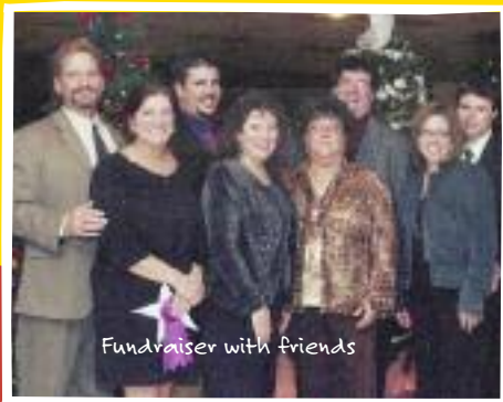
Fundraiser with friends