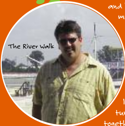
The River Walk